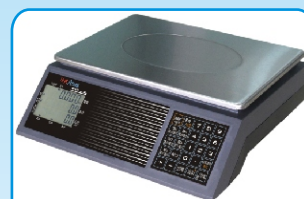
Stainless steel platter optional