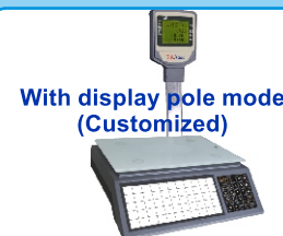
With display pole mode (Customized)